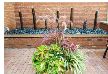
Lincoln Street Entenman Memorial Project Concludes in September 2017