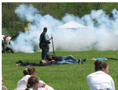
Civil War Reenactment Day with Otsego Local Schools 5 th Annual Event in May 2018