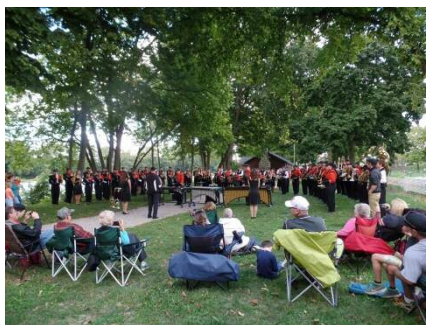
Rhythm on the River Scheduled Sundays June to October 2017 concludes October 1 st , 2017 with Otsego Show Choir & Band