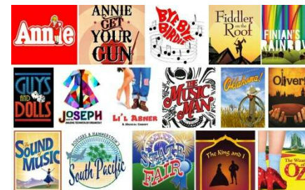
Summer Musical in Town Hall Second weekend in July 27 th year in 2018