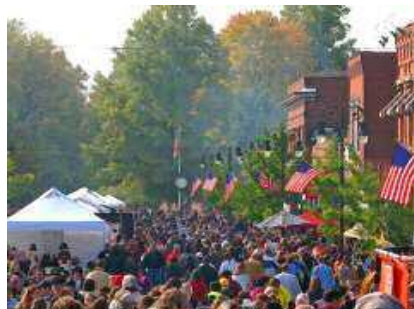
Applebutter Fest Second Sunday in October 41 st Fest on October 8 th , 2017